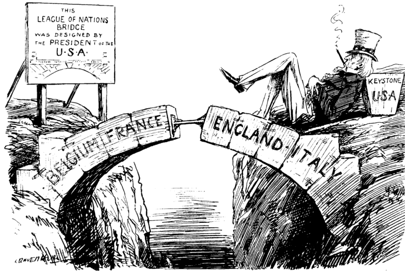
THE GAP IN THE BRIDGE.