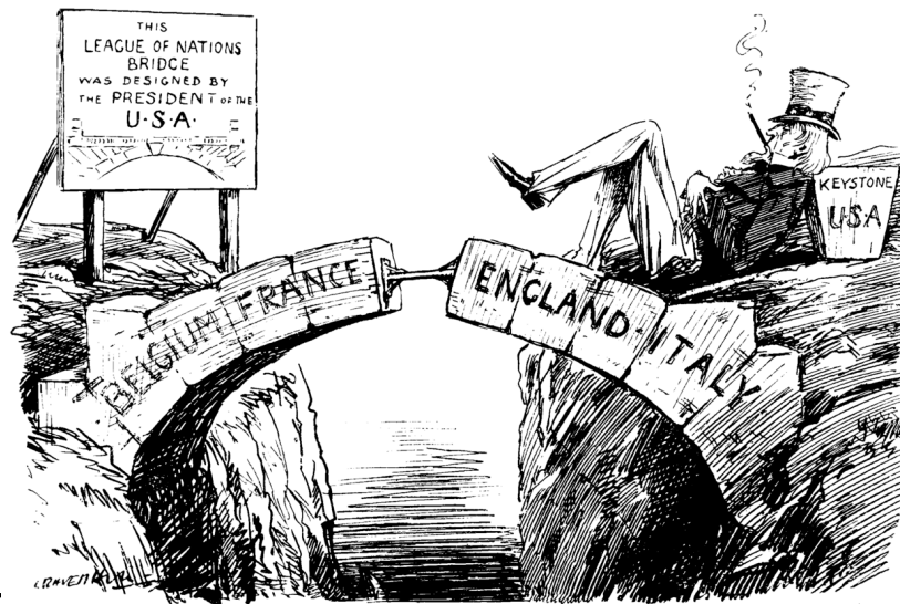
THE GAP IN THE BRIDGE.