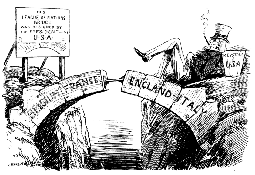
THE GAP IN THE BRIDGE.