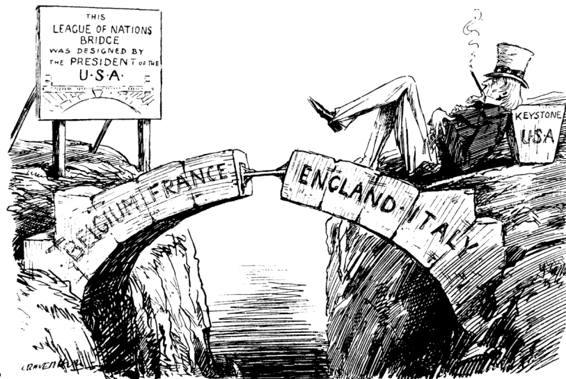
THE GAP IN THE BRIDGE.